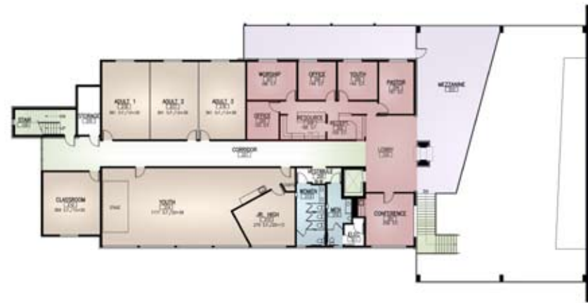
second floor plan