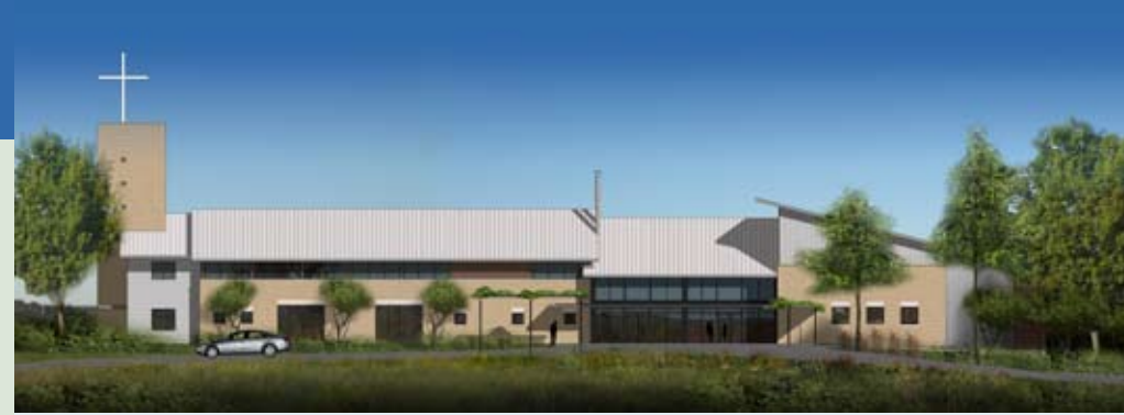
view from parking area

Our 28 acre future campus is located on FM 691 1.2 miles west of Highway 75 between North Loy Lake Road and North Travis Street.